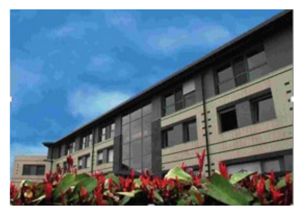
Headquarters in the Paris Region

The support department provides level 1 and 2 services, 7 days a week. It allows MBT to propose a genuine support throughout the year.