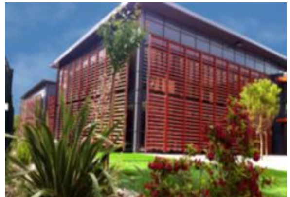
Office in the Toulouse Region