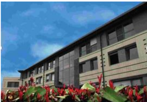
Headquarters in the Paris Region

The R&D department is in charge of new research environments, new objects and development techniques, but also of the integration of new components.